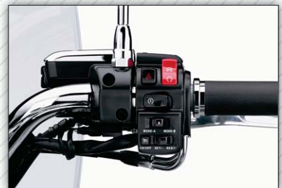
Handy Electronic Cruise Control