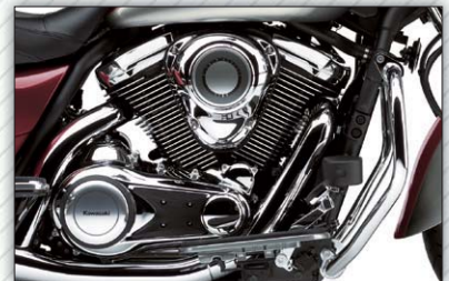
1,700 cm 3 , 50° V-Twin, Liquid-Cooled