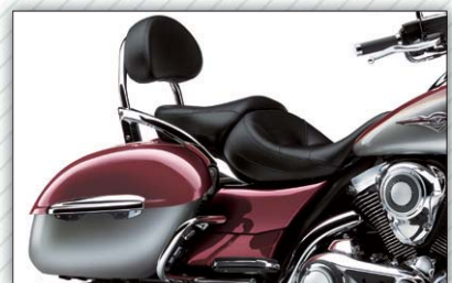
Low Seat and Comfortable Riding Position