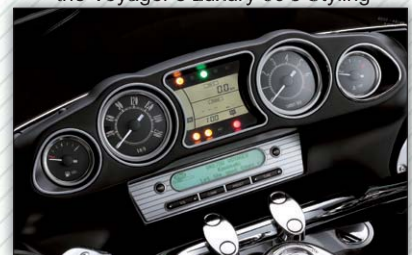
Full Instruments and I-Pod™ Compatible Audio System