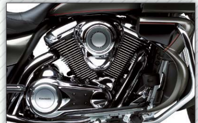
1,700 cm 3 , 50° V-Twin, Liquid-Cooled