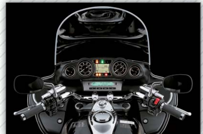
Large Cowling and Screen Complement the Voyager's Luxury 60's Styling